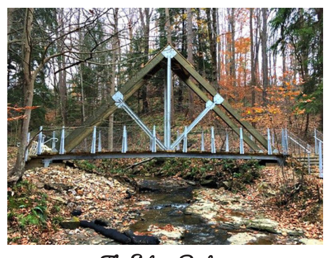
The Eclipse Bridge Erected at the time of the solar eclipse of August 21, 2017.