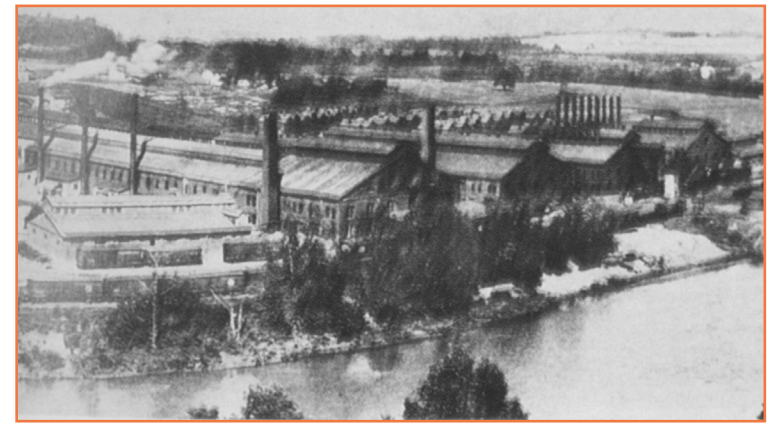
Columbia Plate Glass Works, Blairsville